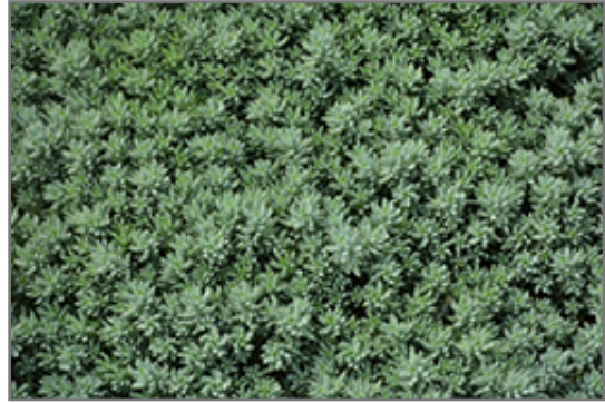
Blue Spruce Stonecrop foliage

Blue Spruce Stonecrop is recommended for the following landscape applications;