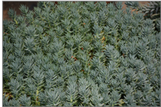
Blue Spruce Stonecrop