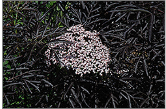
Black Lace Elder flowers