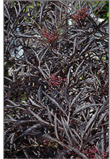
Black Lace Elder flowers

* This is a 'special order' plant - contact store for details