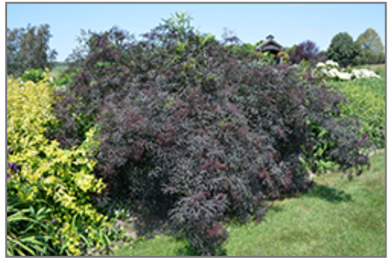
Black Lace Elder