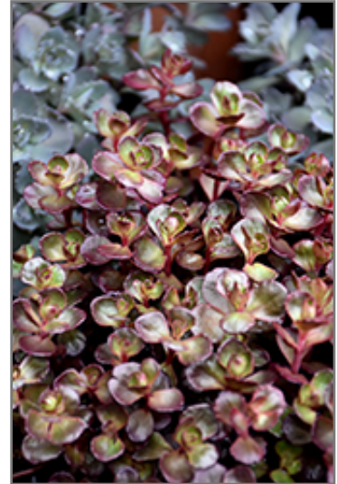
Voodoo Stonecrop foliage

Voodoo Stonecrop is recommended for the following landscape applications;