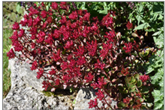
Voodoo Stonecrop in bloom