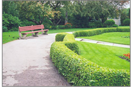
Alpine Currant