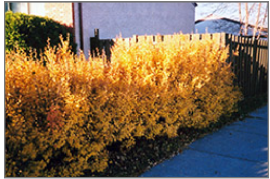
Alpine Currant in fall