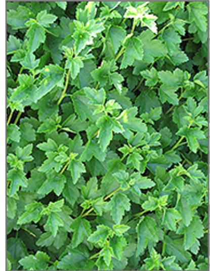
Alpine Currant foliage

* This is a 'special order' plant - contact store for details