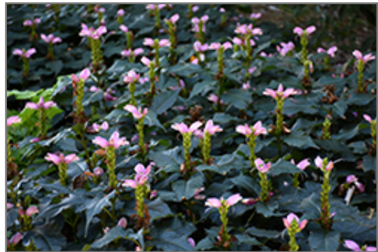
Hot Lips Turtlehead in bloom