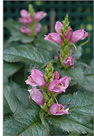
Hot Lips Turtlehead flowers

Hot Lips Turtlehead is recommended for the following landscape applications;