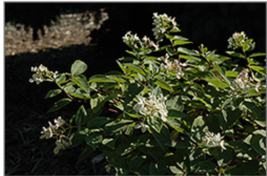
Compact Pee Gee Hydrangea flowers