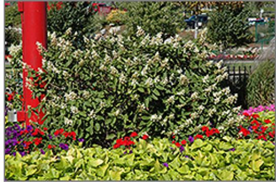
Compact Pee Gee Hydrangea in bloom