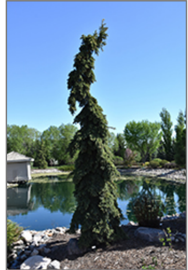
Weeping White Spruce

* This is a 'special order' plant - contact store for details