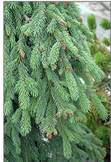
Weeping White Spruce foliage