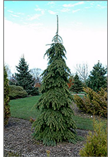
Weeping White Spruce