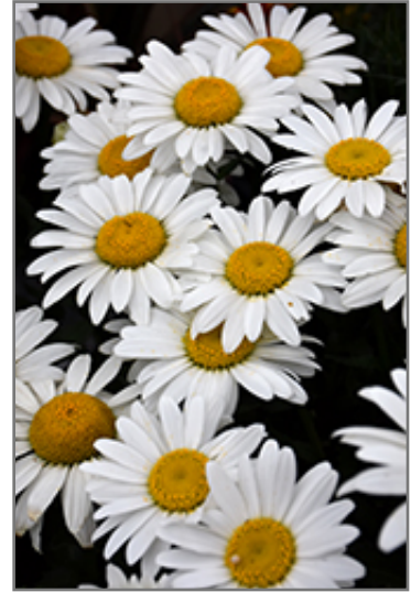
Snowcap Shasta Daisy flowers

A delightful variety of the ever-popular shasta daisy known for a high bloom rate; abundant beautiful white blooms with yellow eyes rise above and graciously contrast the deep green foliage; wonderful choice to mass as a garden focal point