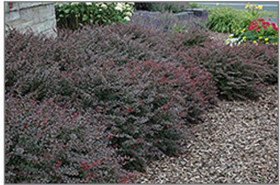
Crimson Pygmy Japanese Barberry