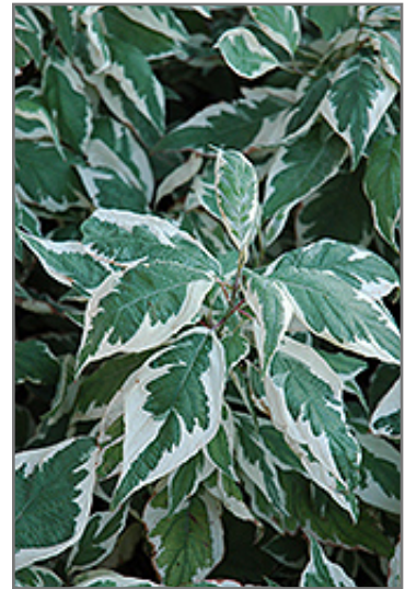
Ivory Halo Dogwood foliage