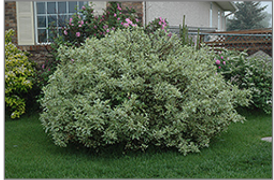
Ivory Halo Dogwood