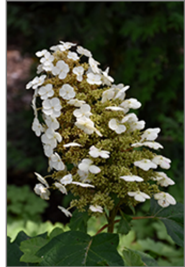
Sikes Dwarf Hydrangea flowers

Sikes Dwarf Hydrangea is recommended for the following landscape applications;