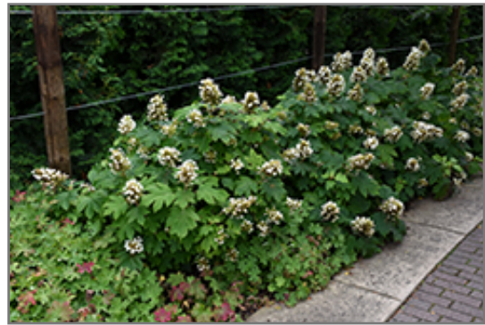
Sikes Dwarf Hydrangea in bloom Photo courtesy of NetPS Plant Finder