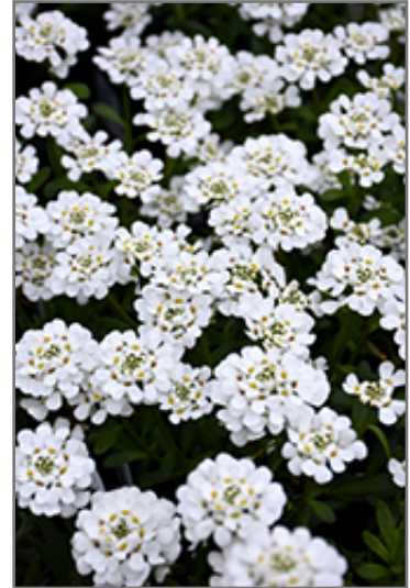
Purity Candytuft flowers