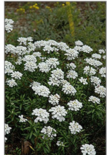
Purity Candytuft flowers