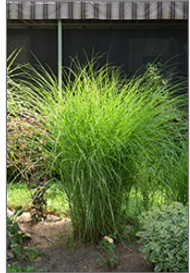
Gracillimus Maiden Grass

* This is a 'special order' plant - contact store for details