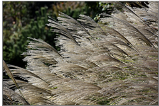
Gracillimus Maiden Grass fruit