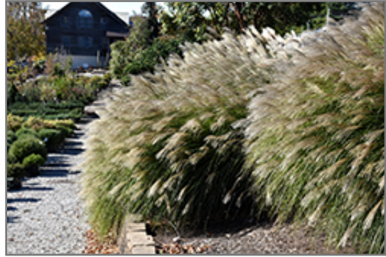
Gracillimus Maiden Grass

Gracillimus Maiden Grass is recommended for the following landscape applications;