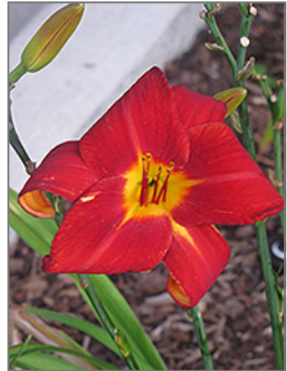
Autumn Red Daylily flowers

Day lilies are commonly grown garden plants; these hardy perennials require practically no maintenance and have large and attractive blooms similar to lily flowers; all parts of the plant are edible although the flowers are the most frequently used