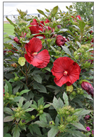
Summerific Cranberry Crush Hibiscus flowers