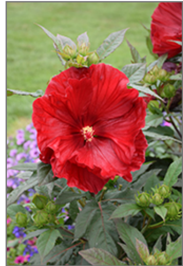
Summerific Cranberry Crush Hibiscus flowers