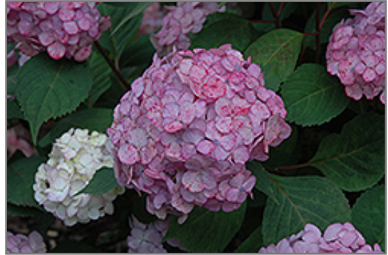
Pink Beauty Hydrangea flowers