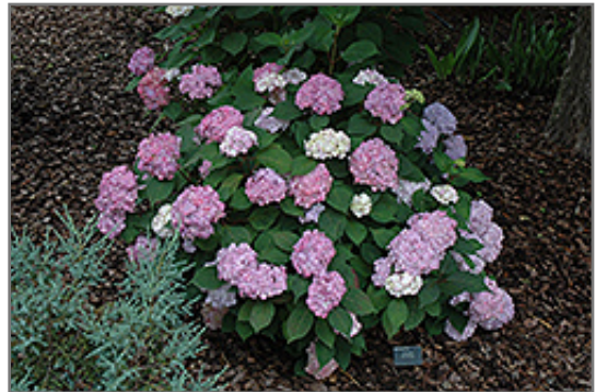
Pink Beauty Hydrangea in bloom