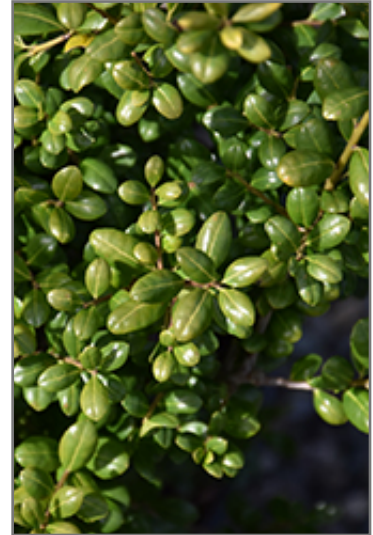
Northern Beauty Japanese Holly foliage

Northern Beauty Japanese Holly will grow to be about 4 feet tall at maturity, with a spread of 4 feet. It tends to fill out right to the ground and therefore doesn't necessarily require facer plants in front. It grows at a slow rate, and under ideal conditions can be expected to live for approximately 30 years.