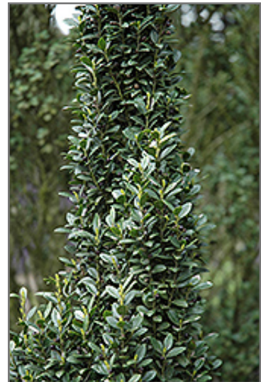
Sky Pencil Holly foliage