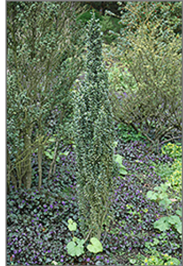
Sky Pencil Holly