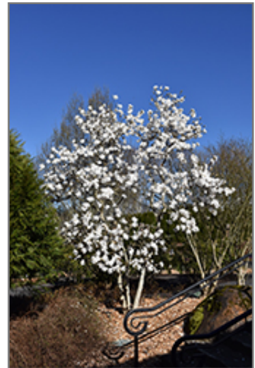
Royal Star Magnolia in bloom