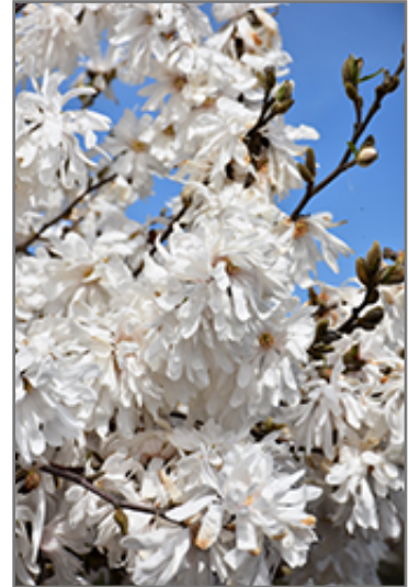
Royal Star Magnolia flowers